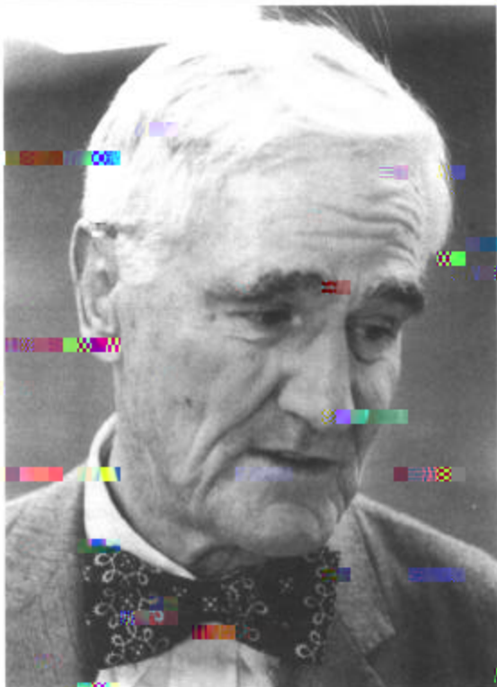
Dr. Donald Cram, 1987 Nobel Laureate in Chemistry and Ninth Annual Distinguished Visiting Lecturer Sponsored by Unocal Corporation.